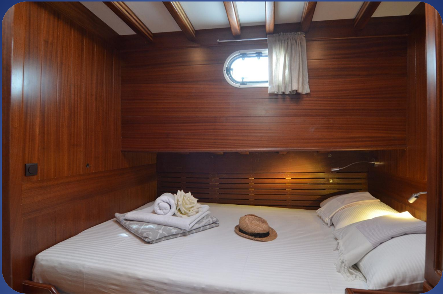
Port side double cabin