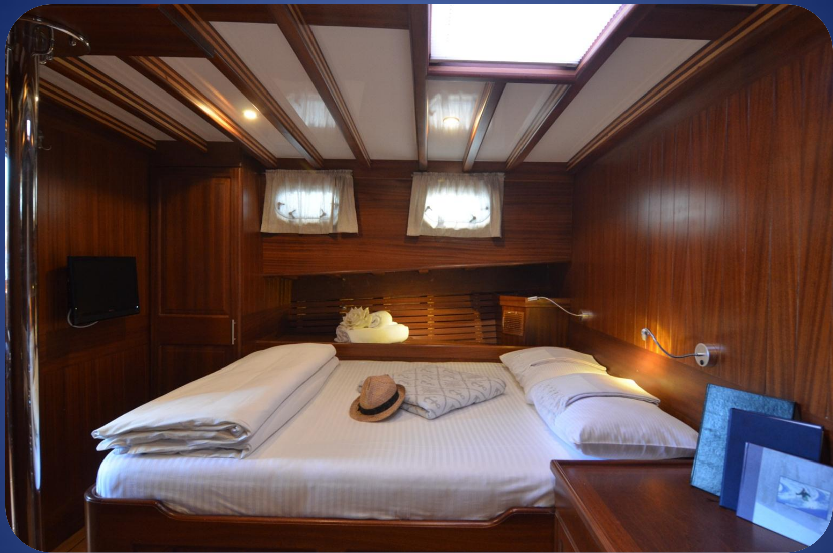
Forward master cabin