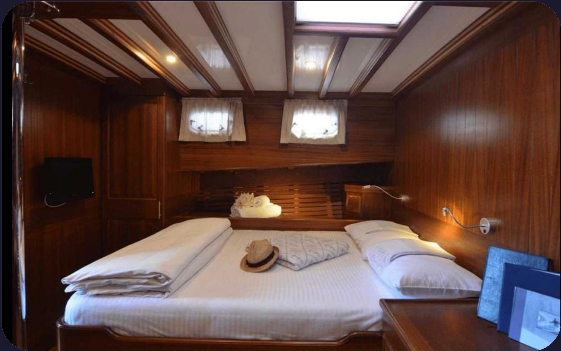
The Master Cabin of Atlas G