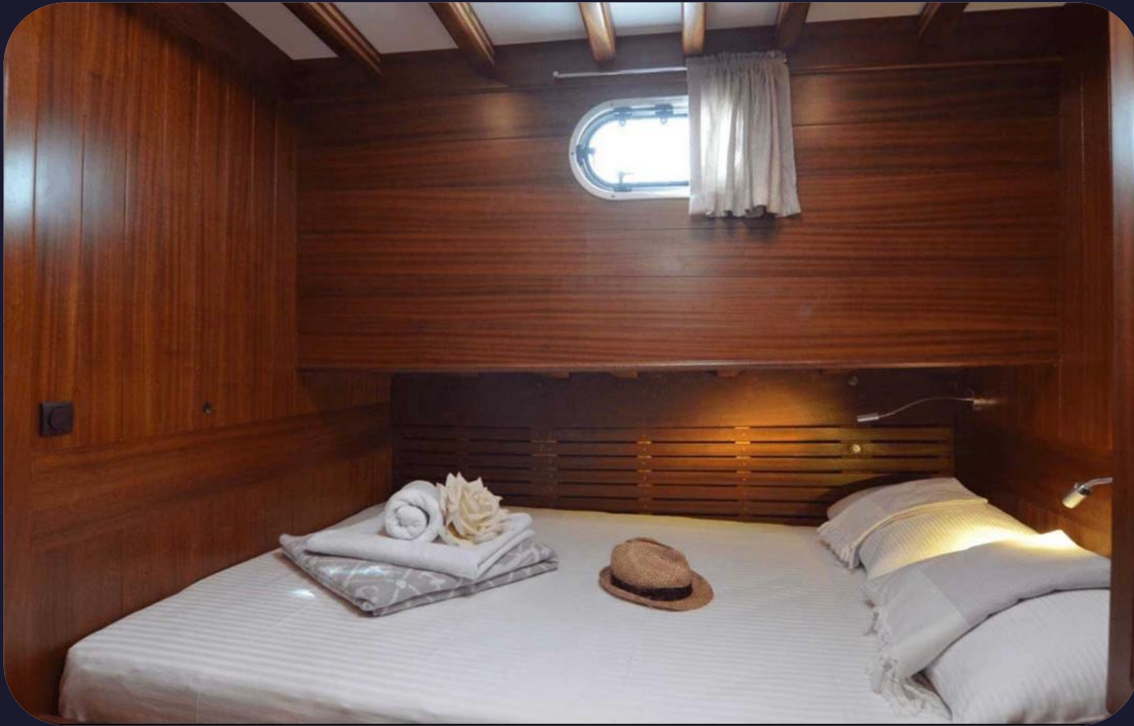
Port double cabin on Atlas G