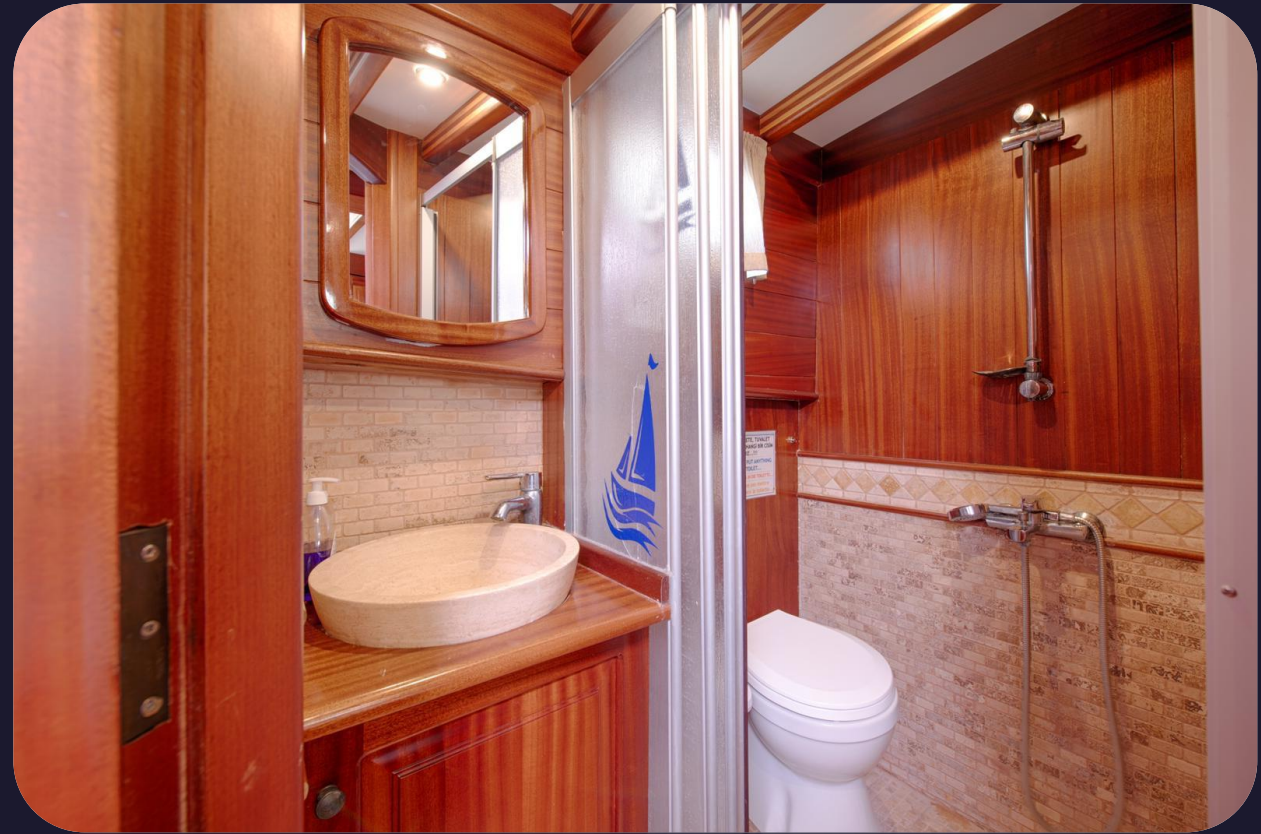
Atlas G features home style toilets and enclosed showers with continuous hot water.