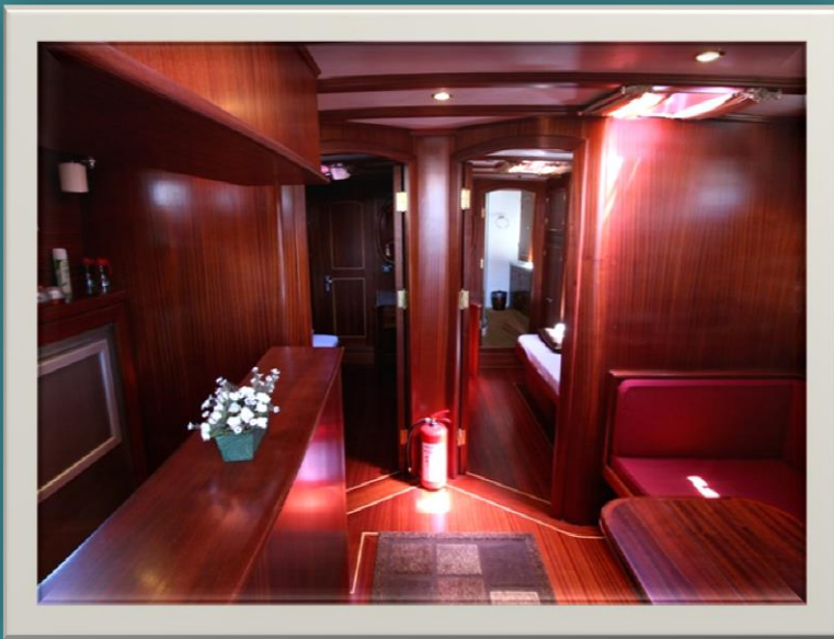
Entry and Corridor to both cabins with galley on the left and seating on the right