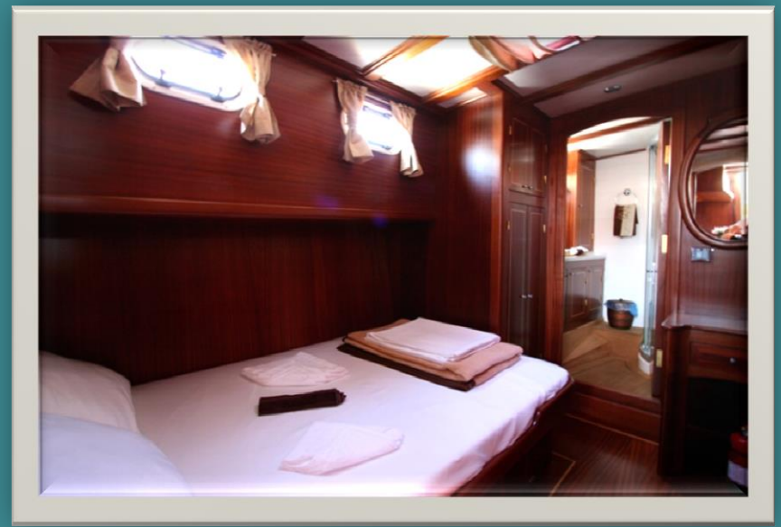
Double cabin with bathroom in the background