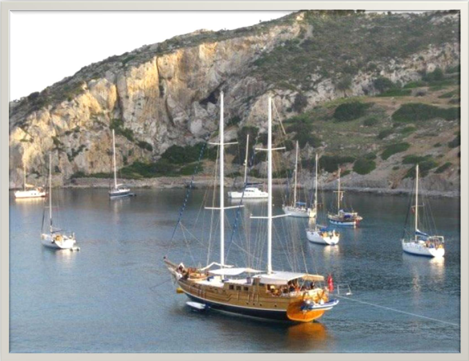
Southern Cross Blue Cruising