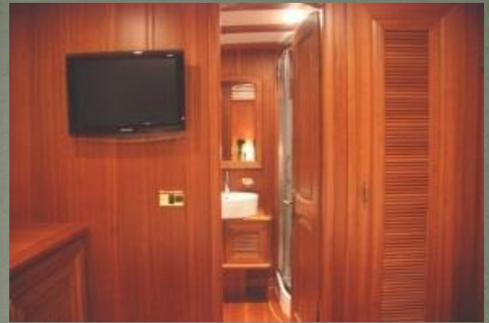
East meets West on L'Orient