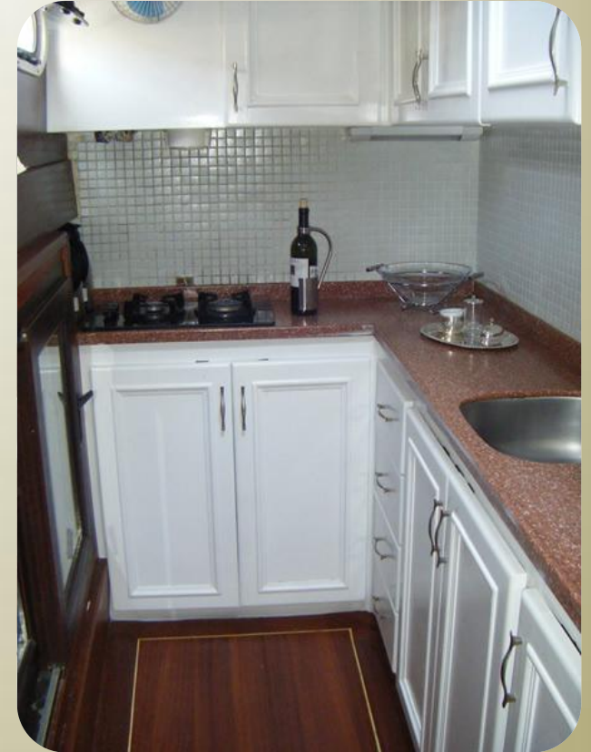
Southern Cross Blue Cruising

Junior has complete navigation equipment, VHF, generator 10 kVA Vetus, 24 + 220 V, life raft, life jackets, fire extinguishers, fully equipped galley, deep freezer, ice boxes, ice maker.