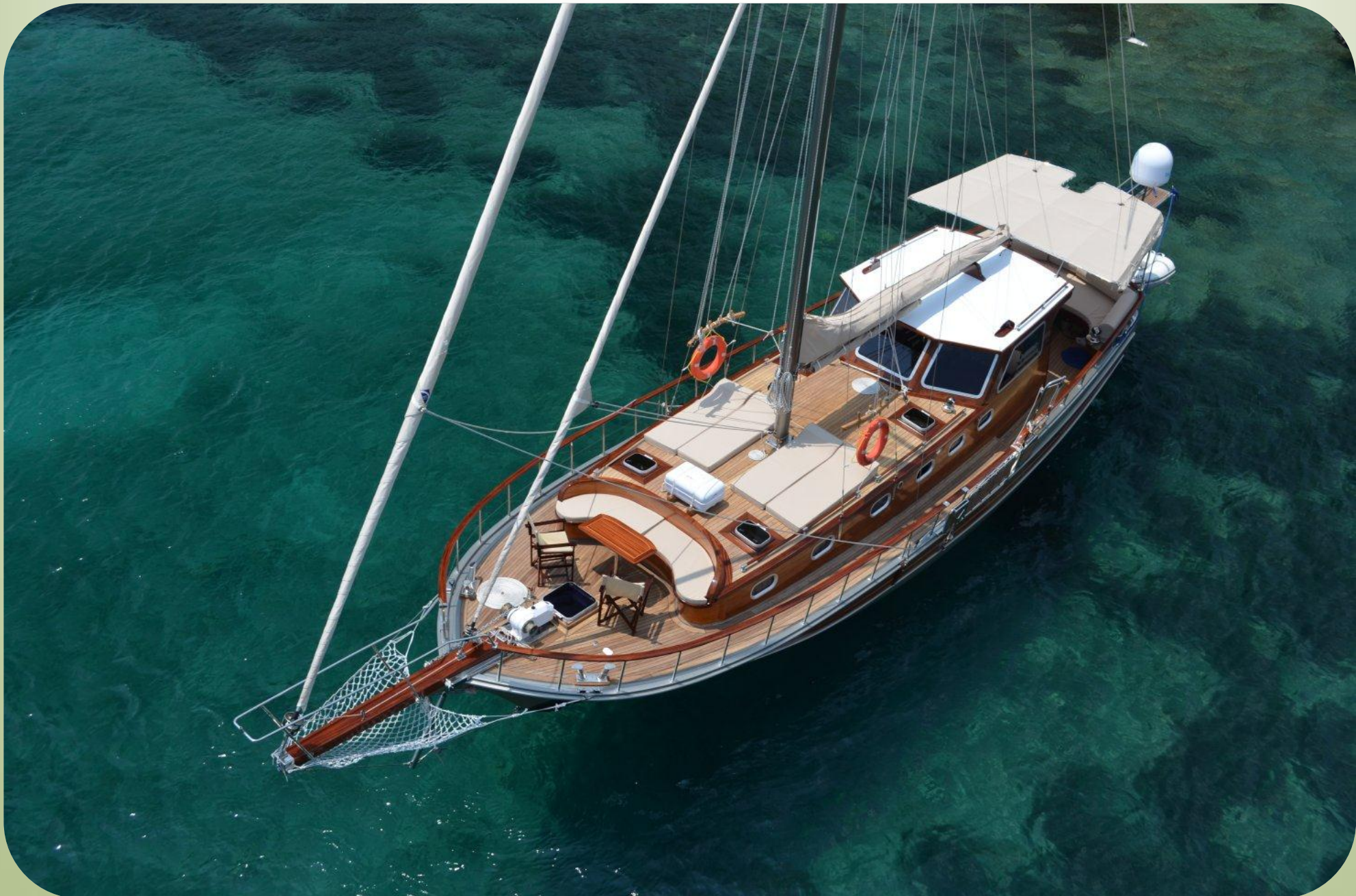
Southern Cross Blue Cruising