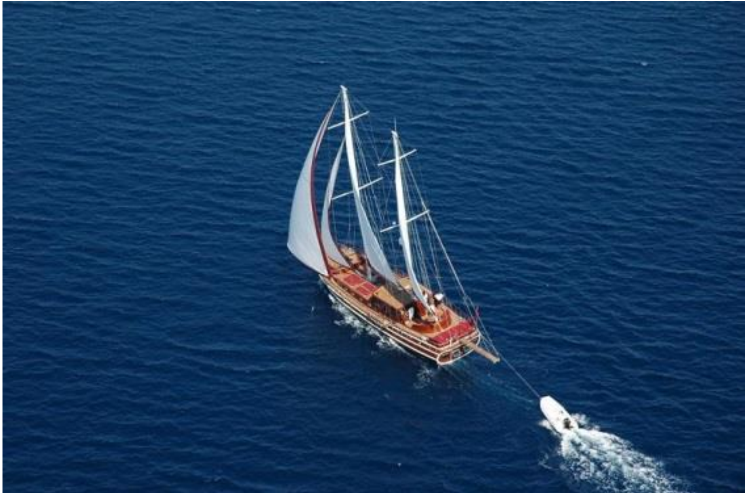
Southern Cross Blue Cruising