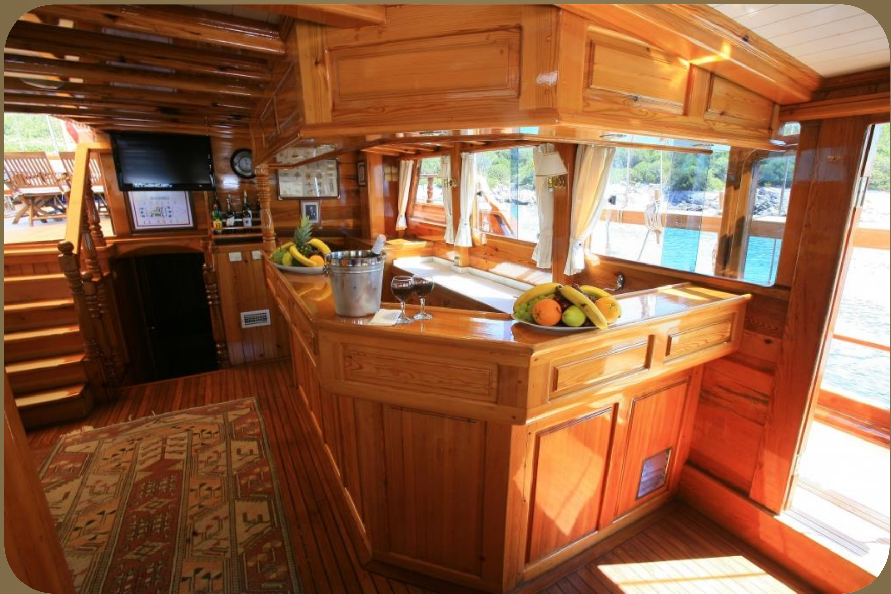
Facing the open bar and galley area in the main saloon